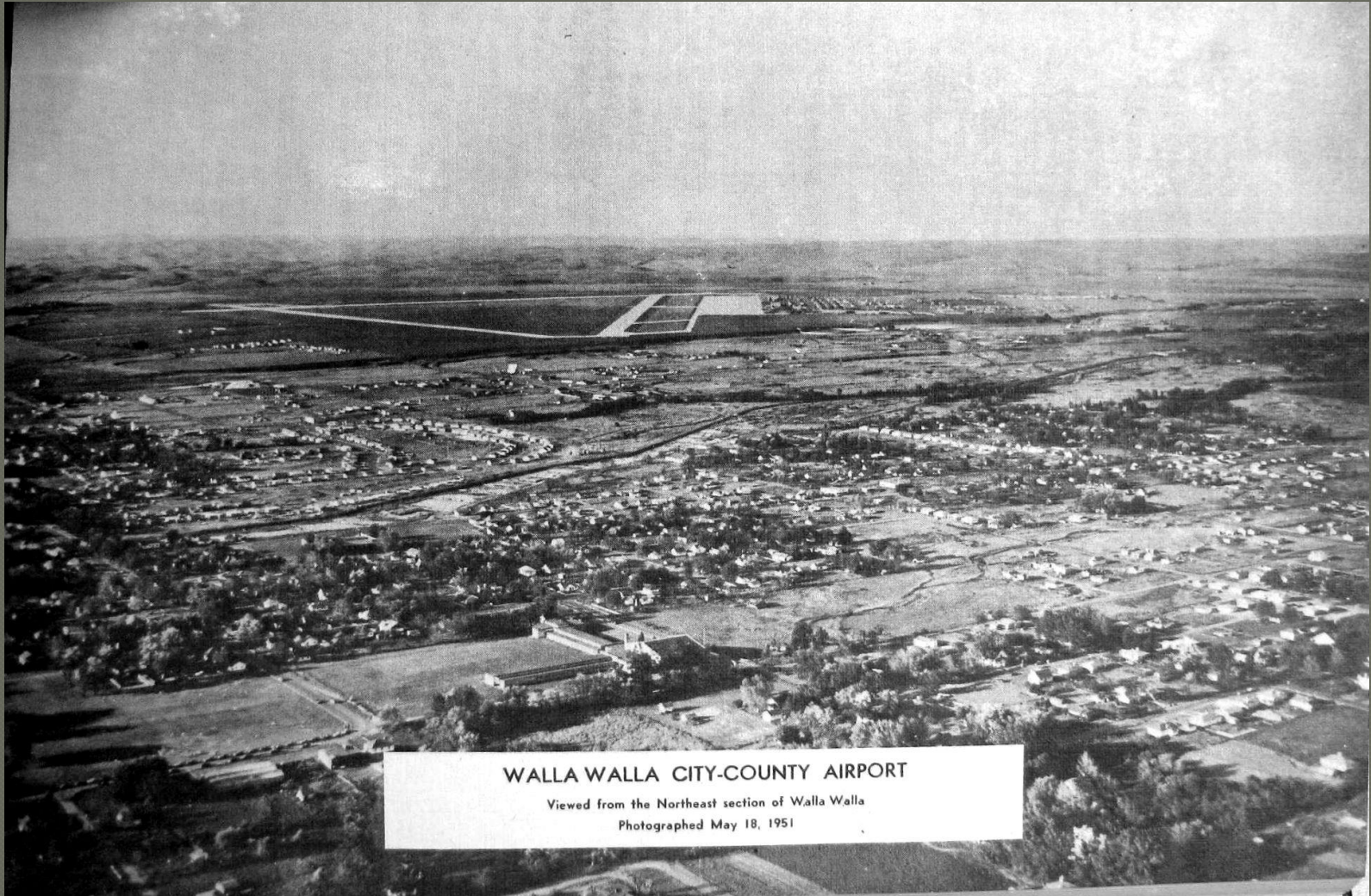
WALLA WALLA CITY-COUNTY AIRPORT

Viewed from the Northeast section of Walla Walla Photographed May 18, 1951